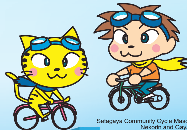
Setagaya Community Cycle Mascots Nekorin and Gayabo

Wear a helmet to prevent injuries in case of an accident.